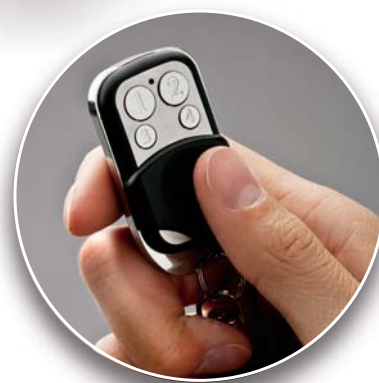
● Remote control with sliding cover to protect controls with an elegant chrome finish