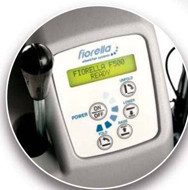
● Multi-language LCD interface