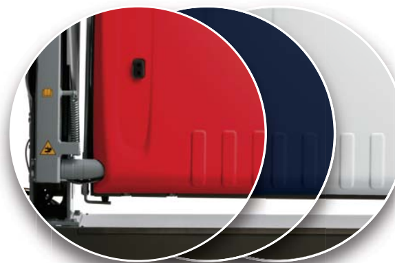
● Platform covers are color customizable